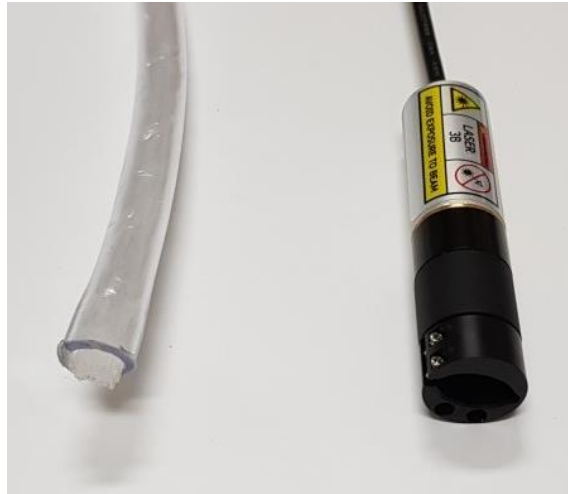
10mm multi-core POF and Mercury-R/G/B-B10