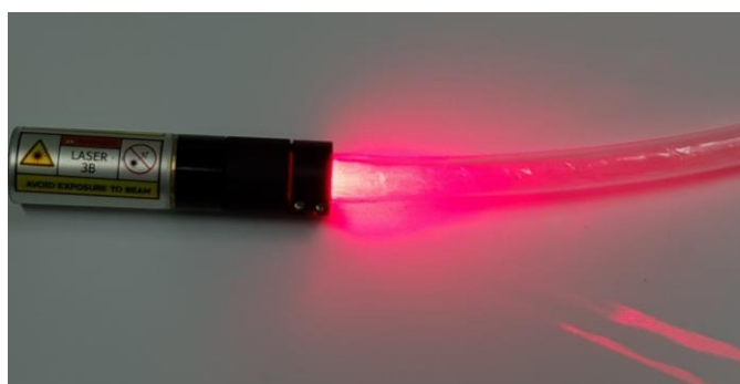
Example of incorrect assembly(POF inserted into only middle)